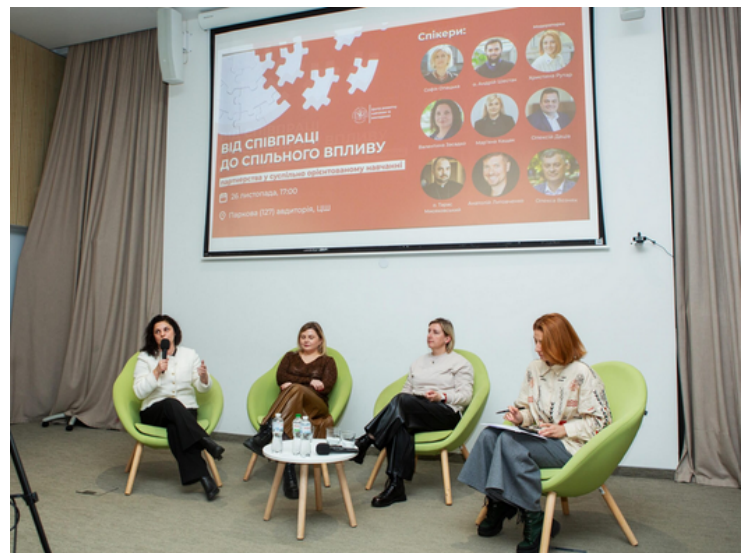
Discussion "From Cooperation to Collective Impact: Partnerships in Service-Learning"

Overall, the Month of Service Learning at UCU reinforces the university's mission to educate socially responsible citizens. It demonstrates how higher education can act as a driver of solidarity and positive change, bridging the gap between theory and practice and contributing to the development of a more engaged and resilient society.